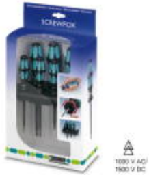
Screwdriver set, bladed/crosshead Pozidriv ® , VDE insulated, 6-part, incl. rack

Please be informed that the data shown in this PDF Document is generated from our Online Catalog. Please find the complete data in the user's documentation. Our General Terms of Use for Downloads are valid ( http://phoenixcontact.com/download )