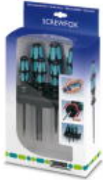
Screwdriver set, bladed/crosshead Pozidriv ® , 6-part, incl. rack

Please be informed that the data shown in this PDF Document is generated from our Online Catalog. Please find the complete data in the user's documentation. Our General Terms of Use for Downloads are valid ( http://download.phoenixcontact.com )