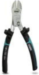
Power diagonal cutter, 200 mm, induction-hardened cutting, VDE 1000 V AC/ 1500 V DC tested

Please be informed that the data shown in this PDF Document is generated from our Online Catalog. Please find the complete data in the user's documentation. Our General Terms of Use for Downloads are valid ( http://phoenixcontact.com/download )