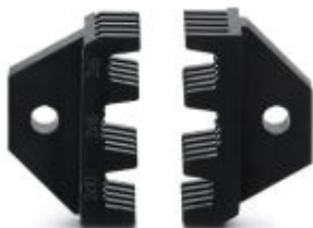
Replacement die for CRIMPFOX 16R TWIN

Please be informed that the data shown in this PDF Document is generated from our Online Catalog. Please find the complete data in the user's documentation. Our General Terms of Use for Downloads are valid ( http://phoenixcontact.com/download )