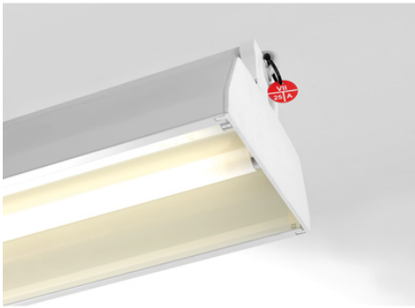
Product is similar to illustration