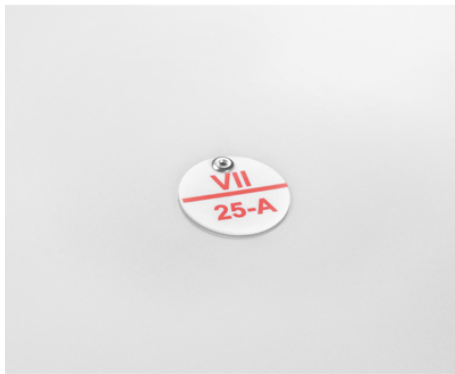
Product is similar to illustration