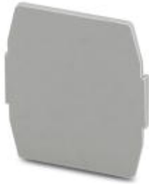
Separating plate, Length: 22 mm, Height: 22 mm, Color: gray

Please be informed that the data shown in this PDF Document is generated from our Online Catalog. Please find the complete data in the user's documentation. Our General Terms of Use for Downloads are valid ( http://download.phoenixcontact.com )