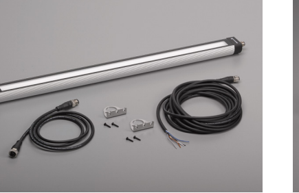
Brad M12 40mm LED Machine Light Kit

M12 Connector Interface Eliminates costly and complicated hard-wiring. Simplifies maintenance and replacement. Delivers IP67 sealing protection for harsh environments