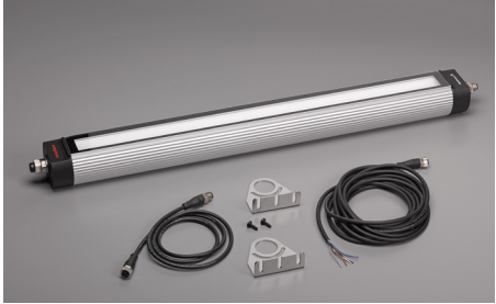
Brad M12 70mm LED Machine Light KIT