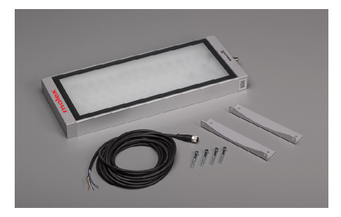
Brad M12 LUMA Wide-Area LED Machine Light Kit

M12 Closure cap to seal off unused M12 connector