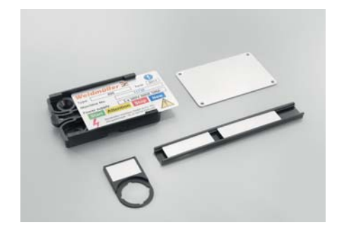
Plate holders and tag rails provide you with excellent versatility and ease of installation. They are available in various versions for the entire range of marking needs.

Our double-sided adhesive labels in all MetalliCard formats guarantee a secure hold on plastic, stainless steel or powder-coated sheet metal.