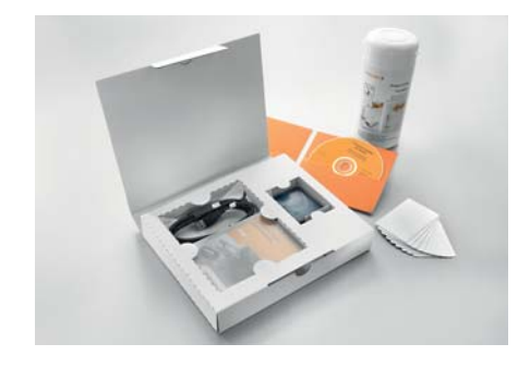
Update kit / Service kit: The PrintJet PRO's firmware ensures that MetalliCards are processed properly.