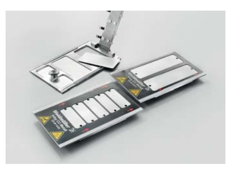
Precise colour printing across multiple tags of the same type – thanks to an inlay-secured printing process.