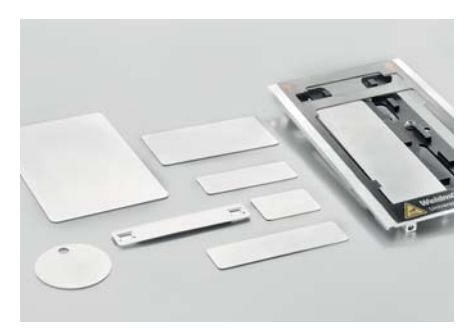
The universal inlay is designed to accept eight different tag types and is particularly suitable for printing small batch jobs.