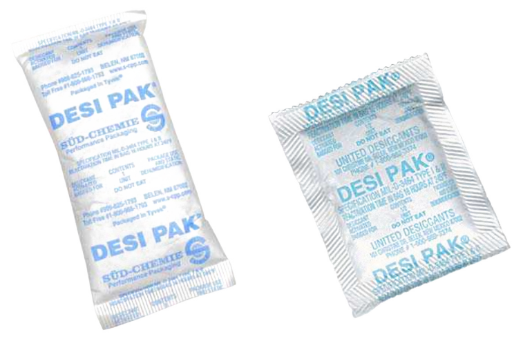
13843 & 13844

In order to provide a complete moisture barrier packaging assembly, desiccant must be inserted into the bag, prior to having the bag vacuum sealed. The recommended amount of desiccant is dependent on the interior surface area of the bag to be used. Figure 4 is a reference table indicating recommended minimum amounts of desiccant that should be used with Moisture Barrier Bags.