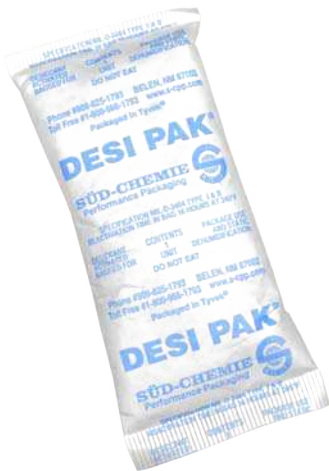
13843 & 13844

In order to provide a complete moisture barrier packaging assembly, desiccant must be inserted into the bag, prior to having the bag vacuum sealed. The recommended amount of desiccant is dependent on the interior surface area of the bag to be used. Figure 4 is a reference table indicating recommended minimum amounts of desiccant that should be used with Moisture Barrier Bags.