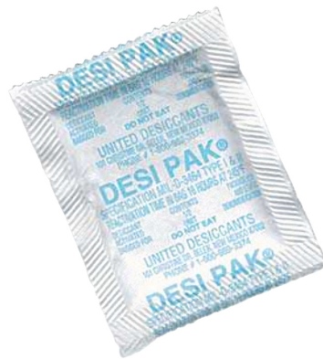
13840 & 13850

"...it is important to take possible temperature exposure into account when shipping electronic parts. It is particularly important to consider what happens to the interior of a package if the environment has high humidity. If the temperature varies across the dew point of the established interior environment of the package, condensation may occur. The interior of a package should either contain desiccant or the air should be evacuated from the package during the sealing process. The package itself should have a low WVTR." (ESD Handbook ESD TR20.20 section 5.4.3.2.2)