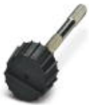
Fillister head screw with plastic knurl, M3 x 40

Screw - SAC-V-SCREW-M3-29 KNURL - 1403779