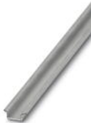
DIN rail, material: Steel, unperforated, height 5.5 mm, width 15 mm, length: 2 m

Please be informed that the data shown in this PDF Document is generated from our Online Catalog. Please find the complete data in the user's documentation. Our General Terms of Use for Downloads are valid ( http://download.phoenixcontact.com )