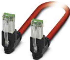
SERCOS III patch cable, shielded, star quad, AWG 22 stranded (7-wire), RAL 3020 (traffic red), RJ45 connector/IP 20, angled, to RJ45 connector/IP20, angled, length: 0.3 m

Please be informed that the data shown in this PDF Document is generated from our Online Catalog. Please find the complete data in the user's documentation. Our General Terms of Use for Downloads are valid ( http://download.phoenixcontact.com )