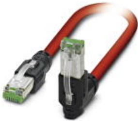
SERCOS III patch cable, shielded, star quad, AWG 22 stranded (7-wire), RAL 3020 (traffic red), RJ45 connector/IP 20, straight, to RJ45 connector/IP20, angled, length: 1.0 m

Please be informed that the data shown in this PDF Document is generated from our Online Catalog. Please find the complete data in the user's documentation. Our General Terms of Use for Downloads are valid ( http://download.phoenixcontact.com )