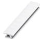
Zack marker strip, Strip, white, Labeled according to customer specifications, Mounting type: Snap into tall marker groove, For terminal block width: 6.2 mm, Lettering field: 6.15 x 10.5 mm