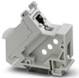
Patch panel, RJ45, DIN rail mounting, IP20, 1 slot, IDC connection, CAT6 A

Please be informed that the data shown in this PDF Document is generated from our Online Catalog. Please find the complete data in the user's documentation. Our General Terms of Use for Downloads are valid ( http://phoenixcontact.com/download )