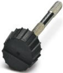
Fillister head screw with plastic knurl, M3 x 40

Please be informed that the data shown in this PDF Document is generated from our Online Catalog. Please find the complete data in the user's documentation. Our General Terms of Use for Downloads are valid ( http://phoenixcontact.com/download )