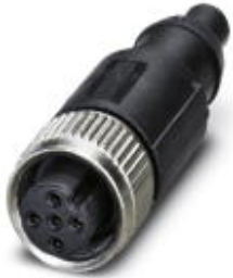
PROFIBUS M12 termination resistor, female connector version

Please be informed that the data shown in this PDF Document is generated from our Online Catalog. Please find the complete data in the user's documentation. Our General Terms of Use for Downloads are valid ( http://phoenixcontact.com/download )