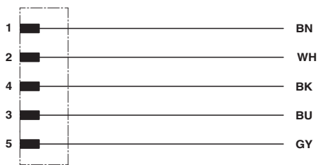
Contact assignment of the M12 plug