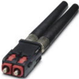
Fiber optic connector SCRJ, IP20, duplex, with fast connection technology, for PROFINET, for HCS fiber 200/230 µm, for individual wire diameter 2.2 mm

Please be informed that the data shown in this PDF Document is generated from our Online Catalog. Please find the complete data in the user's documentation. Our General Terms of Use for Downloads are valid ( http://download.phoenixcontact.com )