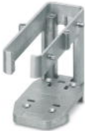
HEAVYCON plug assembly frame, lower part for double locking latch, for sleeve housing with double locking latch or HC-CIF..HFFD..., for type B24 contact inserts

Please be informed that the data shown in this PDF Document is generated from our Online Catalog. Please find the complete data in the user's documentation. Our General Terms of Use for Downloads are valid ( http://download.phoenixcontact.com )