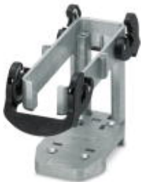
HEAVYCON plug assembly frame, lower part with double locking latch, for sleeve housing without double locking latch or HC-CIF-.HFFD.. upper part, for type B24 contact inserts

Please be informed that the data shown in this PDF Document is generated from our Online Catalog. Please find the complete data in the user's documentation. Our General Terms of Use for Downloads are valid ( http://download.phoenixcontact.com )