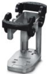
HEAVYCON plug assembly frame, lower part with double locking latch, for sleeve housing without double locking latch or HC-CIF-..HFFD.. upper part, for type B16 contact inserts

Please be informed that the data shown in this PDF Document is generated from our Online Catalog. Please find the complete data in the user's documentation. Our General Terms of Use for Downloads are valid ( http://download.phoenixcontact.com )