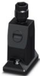
HEAVYCON ADVANCE B6 sleeve housing, with screw locking (Allen screw), plastic, height: 100 mm, with 1 x M20 thread, straight cable outlet

Please be informed that the data shown in this PDF Document is generated from our Online Catalog. Please find the complete data in the user's documentation. Our General Terms of Use for Downloads are valid ( http://download.phoenixcontact.com )