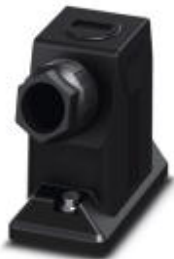
HEAVYCON ADVANCE B10 sleeve housing, with screw locking (Allen screw), plastic, height: 100 mm, with 1 x M32 thread, lateral cable outlet

Please be informed that the data shown in this PDF Document is generated from our Online Catalog. Please find the complete data in the user's documentation. Our General Terms of Use for Downloads are valid ( http://download.phoenixcontact.com )