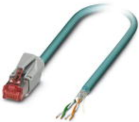
Assembled Ethernet cable, CAT5e, shielded, 2-pair, 26 AWG stranded (7-wire), RAL 5021 (water blue), RJ45 plug/IP20 to free cable end, line, length: 0.5 m

Please be informed that the data shown in this PDF Document is generated from our Online Catalog. Please find the complete data in the user's documentation. Our General Terms of Use for Downloads are valid ( http://phoenixcontact.com/download )