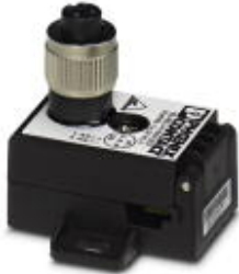
AS-Interface distributor with IP65/IP67/IP69k degree of protection for 1 flat-ribbon conductor, with a straight, A-coded, 2-pos. M12 socket

Please be informed that the data shown in this PDF Document is generated from our Online Catalog. Please find the complete data in the user's documentation. Our General Terms of Use for Downloads are valid ( http://download.phoenixcontact.com )