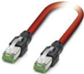
Sercos III patch cable, shielded, star quad, 22 AWG stranded (7-wire), RAL 3020 (traffic red), RJ45 connector/IP20, straight to RJ45 connector/IP20, straight, length: 4 m

Please be informed that the data shown in this PDF Document is generated from our Online Catalog. Please find the complete data in the user's documentation. Our General Terms of Use for Downloads are valid ( http://phoenixcontact.com/download )