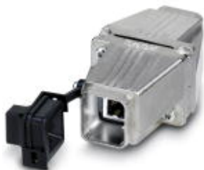
RJ45 push-pull coupling, IP67, metal, CAT5e, with protective cover, color: Nickel-plated

Please be informed that the data shown in this PDF Document is generated from our Online Catalog. Please find the complete data in the user's documentation. Our General Terms of Use for Downloads are valid ( http://phoenixcontact.com/download )