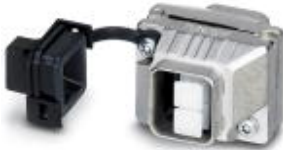
SCRJ push-pull coupling

SCRJ push-pull coupling, IP67, metal, with protective cover, color: nickel-plated