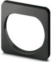
Panel mounting frame for Infrastructure Socket Outlet, Type 2, IEC 62196-2, Thread: M5

Please be informed that the data shown in this PDF Document is generated from our Online Catalog. Please find the complete data in the user's documentation. Our General Terms of Use for Downloads are valid ( http://phoenixcontact.com/download )