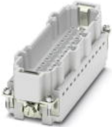
HEAVYCON pin insert, for 830 V (III/3), with 10 N/O contacts and 2 switch contacts, crimp connection

Please be informed that the data shown in this PDF Document is generated from our Online Catalog. Please find the complete data in the user's documentation. Our General Terms of Use for Downloads are valid ( http://phoenixcontact.com/download )