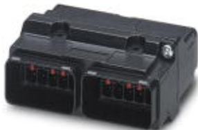
Power H distributor

Power H distributor, 4 x MSTB contact inserts, metal housing, without mounting screws