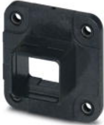
Panel mounting frames, Degree of protection: IP65/67, Material: Plastic

Please be informed that the data shown in this PDF Document is generated from our Online Catalog. Please find the complete data in the user's documentation. Our General Terms of Use for Downloads are valid ( http://phoenixcontact.com/download )