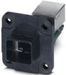
Panel mounting frame set, Degree of protection: IP65/67, Number of positions: 8, Material: Plastic

Please be informed that the data shown in this PDF Document is generated from our Online Catalog. Please find the complete data in the user's documentation. Our General Terms of Use for Downloads are valid ( http://phoenixcontact.com/download )