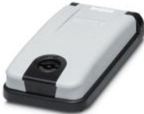
Mounting frame for one front plate/socket, frame: black, cover: gray, closed with 3 mm two-way key bit.

Please be informed that the data shown in this PDF Document is generated from our Online Catalog. Please find the complete data in the user's documentation. Our General Terms of Use for Downloads are valid ( http://phoenixcontact.com/download )