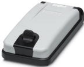
Mounting frame for one front plate/socket, frame: black, cover: gray, closed with rotary knob.

Please be informed that the data shown in this PDF Document is generated from our Online Catalog. Please find the complete data in the user's documentation. Our General Terms of Use for Downloads are valid ( http://phoenixcontact.com/download )