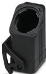
HEAVYCON EVO coupling housing, plastic, with bayonet flange for EVO screw connection, B6, with single locking latch, height: 90 mm, without EVO screw connection

Please be informed that the data shown in this PDF Document is generated from our Online Catalog. Please find the complete data in the user's documentation. Our General Terms of Use for Downloads are valid ( http://phoenixcontact.com/download )