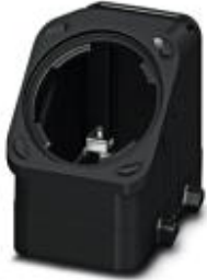
HEAVYCON EVO sleeve housing, plastic, with bayonet flange for EVO screw connection, B10, for double locking latch, height: 60.5 mm, without EVO screw connection

Please be informed that the data shown in this PDF Document is generated from our Online Catalog. Please find the complete data in the user's documentation. Our General Terms of Use for Downloads are valid ( http://download.phoenixcontact.com )