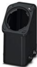
HEAVYCON EVO sleeve housing, plastic, with bayonet flange for EVO screw connection, B10, for double locking latch, height: 87.5 mm, without EVO screw connection

Please be informed that the data shown in this PDF Document is generated from our Online Catalog. Please find the complete data in the user's documentation. Our General Terms of Use for Downloads are valid ( http://phoenixcontact.com/download )