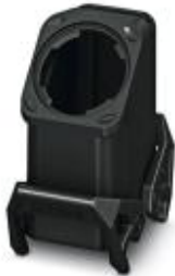
HEAVYCON EVO sleeve housing, plastic, with bayonet flange for EVO screw connection, B10, with double locking latch, height: 87.5 mm, without EVO screw connection

Please be informed that the data shown in this PDF Document is generated from our Online Catalog. Please find the complete data in the user's documentation. Our General Terms of Use for Downloads are valid ( http://download.phoenixcontact.com )