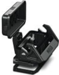
HEAVYCON EVO panel mounting base, plastic, B16, with single locking latch, height: 30.5 mm, with flat gasket, with protective cover

Please be informed that the data shown in this PDF Document is generated from our Online Catalog. Please find the complete data in the user's documentation. Our General Terms of Use for Downloads are valid ( http://download.phoenixcontact.com )