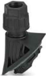
EVO plastic cable gland with bayonet locking, for housing series B, size M20, cable diameter: 7 ... 13 mm

Please be informed that the data shown in this PDF Document is generated from our Online Catalog. Please find the complete data in the user's documentation. Our General Terms of Use for Downloads are valid ( http://phoenixcontact.com/download )