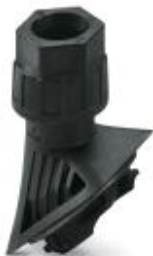
EVO plastic cable gland with bayonet locking, for housing series B, size M25, cable diameter: 9 ... 17 mm

Please be informed that the data shown in this PDF Document is generated from our Online Catalog. Please find the complete data in the user's documentation. Our General Terms of Use for Downloads are valid ( http://phoenixcontact.com/download )