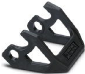
Replacement double locking latch for HEAVYCON EVO housing, HC-B10/HC-B16/HC-B24, PA

Please be informed that the data shown in this PDF Document is generated from our Online Catalog. Please find the complete data in the user's documentation. Our General Terms of Use for Downloads are valid ( http://phoenixcontact.com/download )