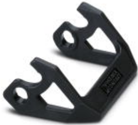
Replacement single locking latch for HEAVYCON EVO housing type B6, PA

Please be informed that the data shown in this PDF Document is generated from our Online Catalog. Please find the complete data in the user's documentation. Our General Terms of Use for Downloads are valid ( http://phoenixcontact.com/download )