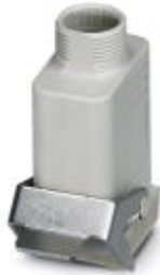
Coupling housing with single locking engagement nose, for HC-COM-K-KV-PG16...screw connection

Please be informed that the data shown in this PDF Document is generated from our Online Catalog. Please find the complete data in the user's documentation. Our General Terms of Use for Downloads are valid ( http://download.phoenixcontact.com )