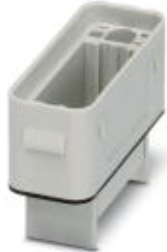
Plastic panel mounting base for modules for a module slot, with PE marking for pos. 1, for snap locking

Please be informed that the data shown in this PDF Document is generated from our Online Catalog. Please find the complete data in the user's documentation. Our General Terms of Use for Downloads are valid ( http://download.phoenixcontact.com )