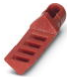
Coding profile for HC-MOD-K... housing