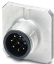
Sensor/actuator flush-type connector, 8-pos. plug, M12, A-coded, front/square flange mounting, wave soldering

Please be informed that the data shown in this PDF Document is generated from our Online Catalog. Please find the complete data in the user's documentation. Our General Terms of Use for Downloads are valid ( http://phoenixcontact.com/download )